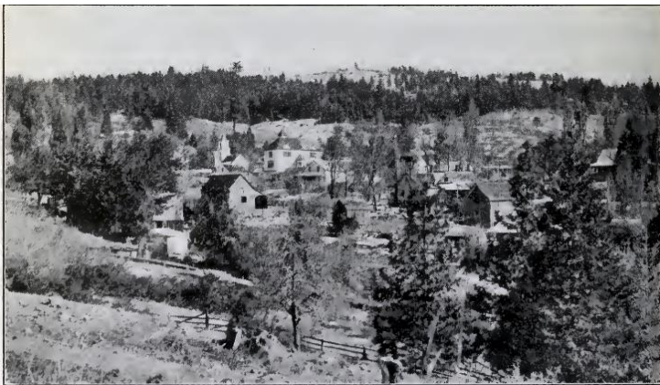
Photo No. 12. View eastward towards the town of Dutch Flat. The X in center marks the location of the Federal Drift shaft.

Excelsior. Forest Hill district. Sec. 26, T. 14 N., R. 10 E., M. D. M. Worked through the New Hope, 3500 foot bed-rock, tunnel with portal in Sec. 35, T. 14 N., R. 10 E., M. D. M. One-half mile southeast of Forest Hill. The channel is on the Blue Lead and was located in the early 70 's but was not worked until 1913. The company now owns all claims between the Dardanelles and the Gore, including also the Banner and the Garland Mill Slope, including about 2000 acres. The channel northeast of here has all been worked out through the Mayflower and Paragon tunnels. The channel varies from 20 feet to 100 feet wide and has a course about N. 20° E. The bed rock is slate and the cement blue gravel requires blasting. Work consists of drifting along the channel and stoping out the chambers. Mine equipment consists of a 350-cubic-foot air compressor and eight Ingersoll and Sullivan air drills. Electric power, 700 h. p., is brought from Horseshoe Bar. The gravel is screened through a revolving grizzly lined with T-rails and the fine material run through a 6-stamp triple discharge mill. Six months gravel was blocked out