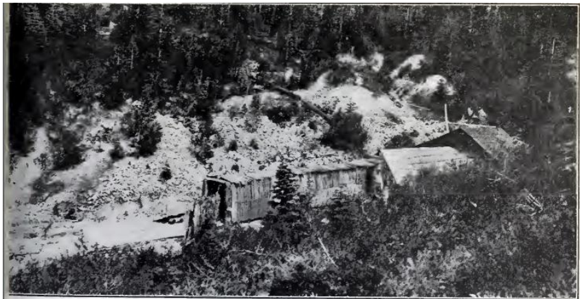
Photo 14. Tunnel entrance to Monumental Mine, Canada Hill District, Placer County.

Monumental. Canada Hill district. Sec. 4, T. 15 N., R. 13 E., M. 0. M., 8 miles east of Westville. Elevation 5300 feet. Five claims. Two hundred acres. Adjoins the Golden "West property. A gravel channel running N. 60° W. is about 80 feet wide, with andesite capping. Tunnel 400 feet with some drifting. A 5 h. p. gasoline engine is used to run a barrel mill 8' long x 30" in diameter for loosening up the values. Eighty feet of sluice boxes. Three men work all year. Eighteen hundred feet of Reed channel worked out.