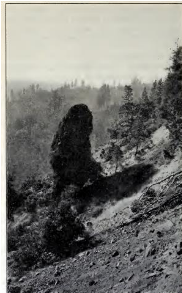
Photo No. 11. Devil's Horn, in Devil's Basin, on the eastern slope of Deadwood Ridge, at head of the trail to Last Chance. The "horn" shows how the andesite has intruded the slates and gravels in places.

Dixie Queen Mine. Last Chance district. Sees. 9, 16 and 17, T. 14 N., R. 13 E., M. D. M., 9 miles southeast of Last Chance on the west side of Duncan Canon and south of the Blue Eyes property. Elevation 4000 feet. Two hundred and forty acre claim. Cement gravel channel on slate with capping of andesite. Course of channel SW. Tunnel 700 feet. Breasted for 240'; 600' of crosscuts. Gravel washed in