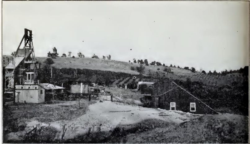
Photo No. 10.—Headframe and mill of the Oro Fino Mining Co., on Bullion No. 1, Ophir District.

About 30 tons of ore per day of 24 hours is milled. Mill tests are reported to have run from $17.00 to $18.00 per ton. About 70% of the gold is recovered on the amalgamation plates, while from 25% to 30% is recovered from the sulphurets. The ore taken