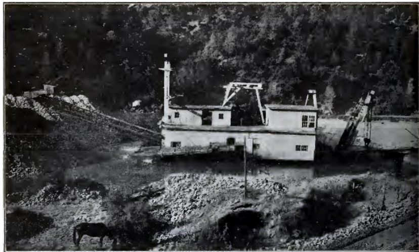
Photo No. 30. Bucyrus Dredger of the Pacific Gold Dredging Co., working near Mammoth Bar on the Middle Fork of the American River.