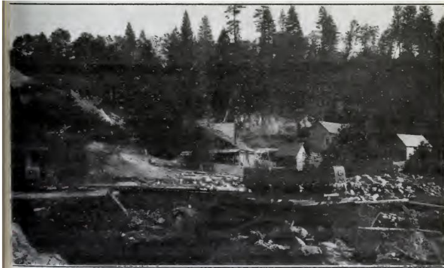
Photo No. 18. View eastward of the Pacific Slab Mine, Last Chance District, showing office, cook house, gravel bin and hydraulic monitor.

Pacific Slab Mine. Last Chance district. Sees. 27, 28, 33 and 34, 15 N., R. 12 E., M. D. M., 1½ miles southwest of Last Chance. Twelve miles by steep trail from Michigan Bluff. Five hundred and twelve acres. Claims : Pacific Slab, Bob Lewis, New York and Ohio. Discovered about 1852 and worked