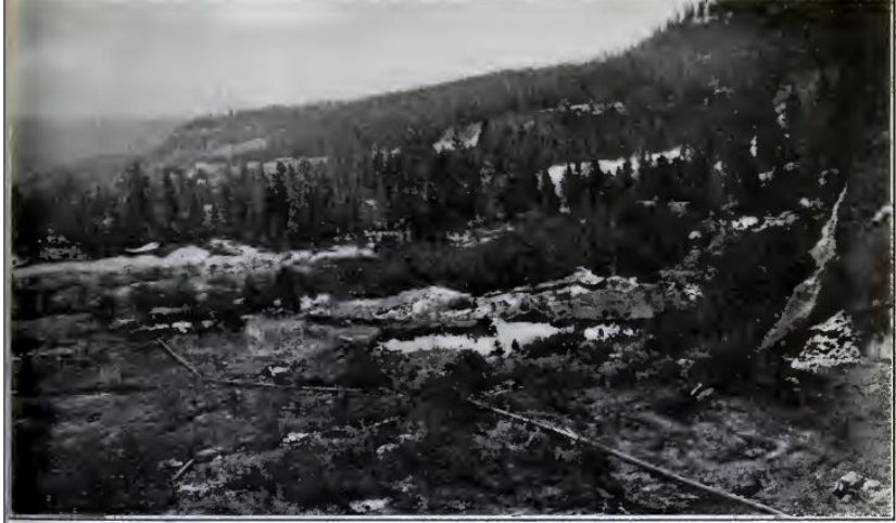
Photo No. 21. Old hydraulic workings, just northwest of Gold Run. The bedrock is rapidly being covered by a growth of pine trees, the largest of which probably date back to 1893.

Since the Federal antidebris laws of 1893 went into effect, hydraulic mining in Placer County has practically ceased. The tailings from the Dutch Flat region were washed into the Bear River, where, with those from You Bet, Red Dog and other districts in Nevada County, they filled the river bed in places 10 feet to 20 feet deep. Dams have been projected by the California Debris Commission at points both north and west of Colfax, on the Bear River, to restrain tailings from these districts, but the sites have been held at such exorbitant prices by the owners that it has