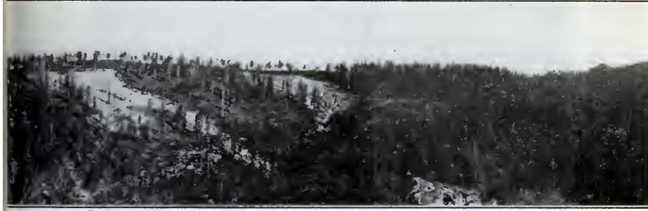
Photo No. 23. Park and Brown Hydraulic Mine, four miles southeast of Canada Hill, Placer County. Duncan Peak lies in the distance to the right.

Park and Brown. Last Chance district. Sec. 21, T. 15 N., R. 13 E., M. D. M., 12 miles northeast of Last Chance near the wagon road from Westville to Last Chance over Bald Mountain. Elevation 6480'.