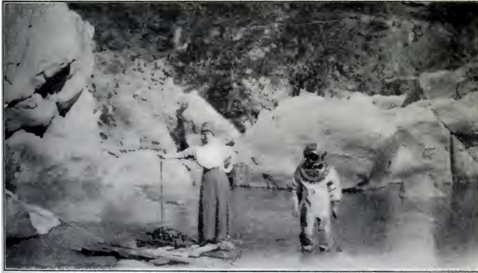
Photo No. 28. Diving outfit used for the recovery of gold from the deep pools in the bed of the North Fork of the American River, east of Colfax.

Rocky Bar or Estey. Colfax district. Sec. 1, T. 14 N., R. 9 K, D. M.. 3 miles east of Colfax and ½ mile below the Iowa Hill bridge on the North Fork of the American River. The property is reached by a trail along the south side of the American River from the Iowa Hill road. Elevation 1050'. Claims "Swastika," "First Chance," "Rocky Bar," "Rocky Bar Extension." The claims include bench gravels along the river which are shoveled into sluice boxes and washed with water pumped from the river by a