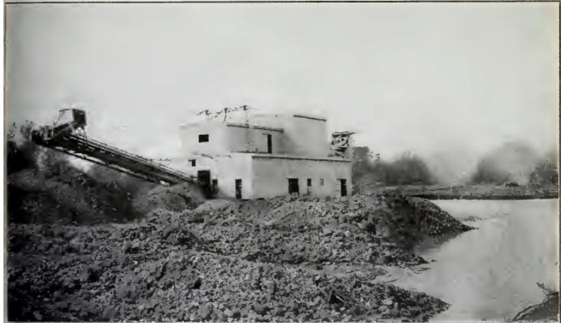
Photo No. 29. Gardella Dredge, near Virginia, four miles northeast of Lincoln, working gravel and alluvial deposits north of Auburn ravine.