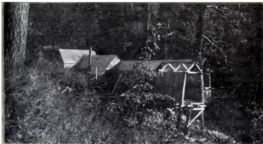
Photo 13. Glenn Mine, eight miles east of Last Chance, Placer County.