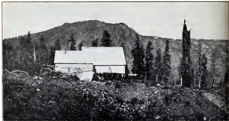
Photo 9. Lost Emigrant Mine, eight miles southwest of Soda Springs, Placer County. Snow Mountain in the distance.

Elevation 6700 feet. Twelve-inch to 4-foot quartz vein in diabase porphyrite, carries free gold and pyrite. Strike NW.-SE., dip 30° SW. Shaft 115 feet. Incline 500 feet. Drifting, 400 feet on 65-foot level 50 feet on 300-foot level, 50 feet on 500-foot level. Old steam