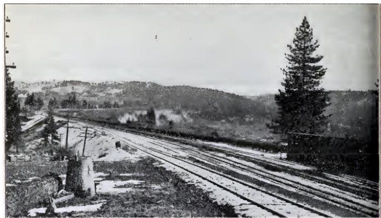
Photo No. 15. View northeastward up the railroad right of way near Gold Run, showing hydraulic gravel banks and pit to the right.

Morning Star. Iowa Hill district. Sees. 33 and 34, T. 15 N., R. 10 E., M. D. M., one mile northwest of Iowa Hill. Elevation 2700 feet Patented 160 acres. Reported to have 5500 feet along a gravel channel: Tunnel 4800 feet. Shaft 488 feet.