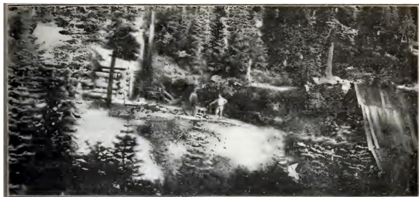
Photo 17. Camp, at the Pacific Blue Lead Drift Mine, Canada Hill District, Placer County.

Pacific Blue Lead or George Fulton. Canada Hill district. Sec. 4 and 5, T. 15 N., R. 13 E., M. D. M. Elevation 6320'. Four hundred and thirty acres. Claim 1 mile along a blue channel 11' deep and 150 wide in which the gravel benches above the bedrock ran from $0.50 to $37.00 per car;