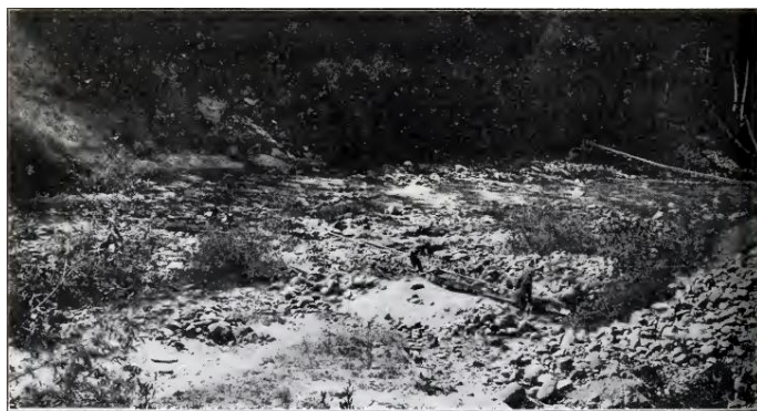
Photo No. 27. Sluicing bench gravels on the south side of the North Fork of the America River, one-half mile below the Iowa Hill bridge, east of Colfax. A small gas engine is used to pump water from the river into the sluice boxes.

Martin. Iowa Hill district. Sec. 31, T. 15 N., R. 10 E., M. D. M 2 miles west of Iowa Hill, along the bed of the North Pork of the American River. Twenty acres. Some