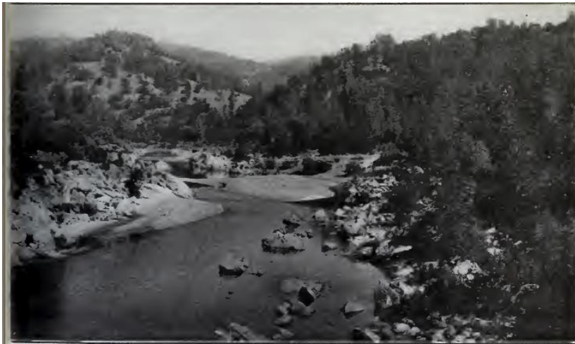
Photo No. 26. Gravel bars along the American River, just above (east of) Rattlesnake bridge. Old hydraulic tailings are said to cover virgin auriferous gravels in these bars which could be worked to advantage by hydraulic elevators. The hard, rugged, granitic bedrock would probably make dredging unfeasible.