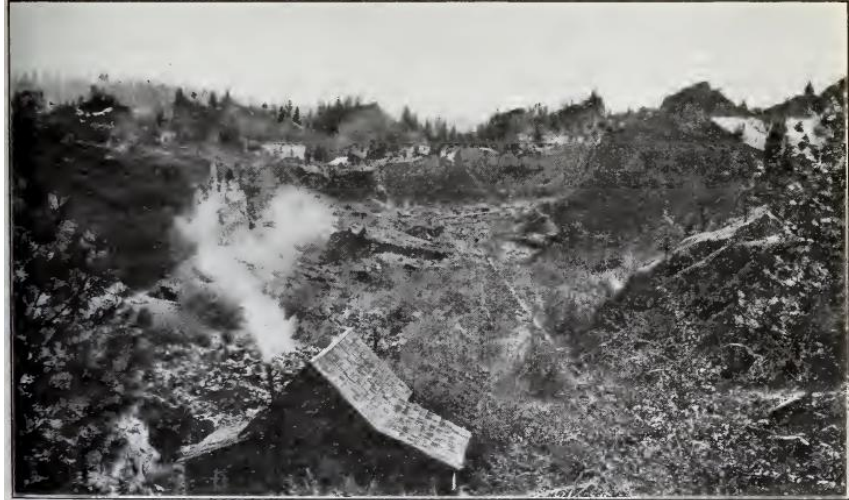
Photo No. 20. Stewart Gravel Mine, near Gold Run. The tailings pile, from the drift workings, may be seen just back of the superintendent's house.