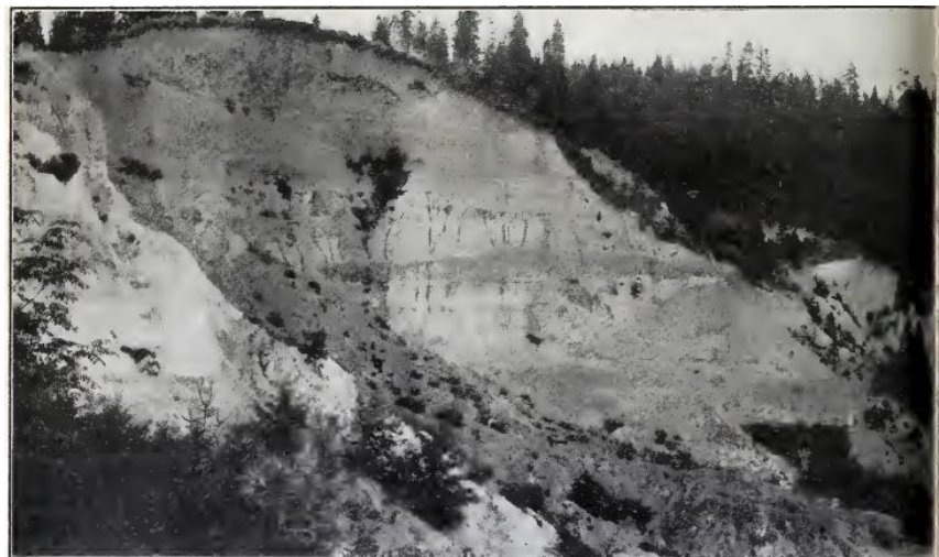
Photo No. 19. Hydraulic bank above the old Paragon tunnel at Bath, Forest Hill District, showing lens-shaped gravel strata.

Paragon or Breece and Wheeler Mine. Forest Hill district. Sees: 19, 24 and 30, T. 14 N., R. 11 E., M. D. M., 2 miles northeast of Forest Hill. Elevation 2900 feet. Five hundred acres patented. Cemented gravel channel in amphibolite and serpentine capped by andesite. A tunnel