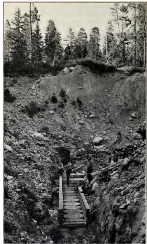
Photo No. 24. Installing sluice boxes for hydraulicking at the Pine Nut Mine, Canada Hill District, Placer County.