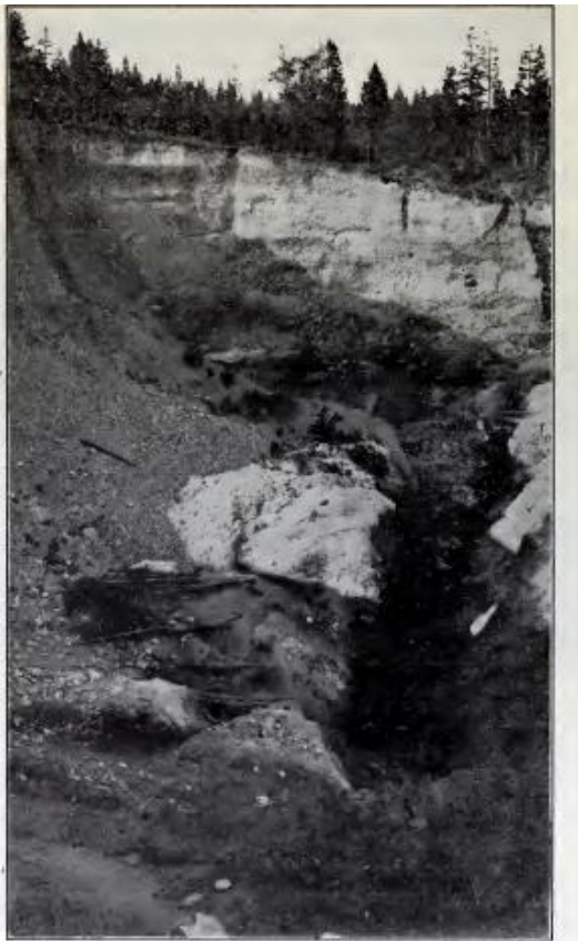
Photo No. 22. Lost Camp Placer Mine, Blue Canyon, Placer County.

not been economically possible to carry out the plans. When such methods can be applied the dams can be paid for by a tax on those operating. These dams could act as storage reservoirs for water supply, from which hydroelectric power could be generated, well as for the gravel tailings, and would be beneficial to the country in many ways.