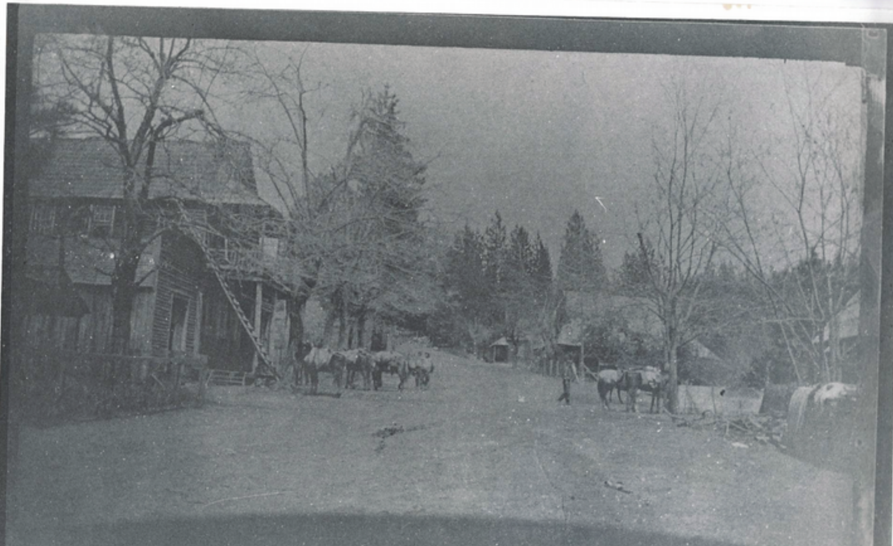
main St. LAST CHANCE