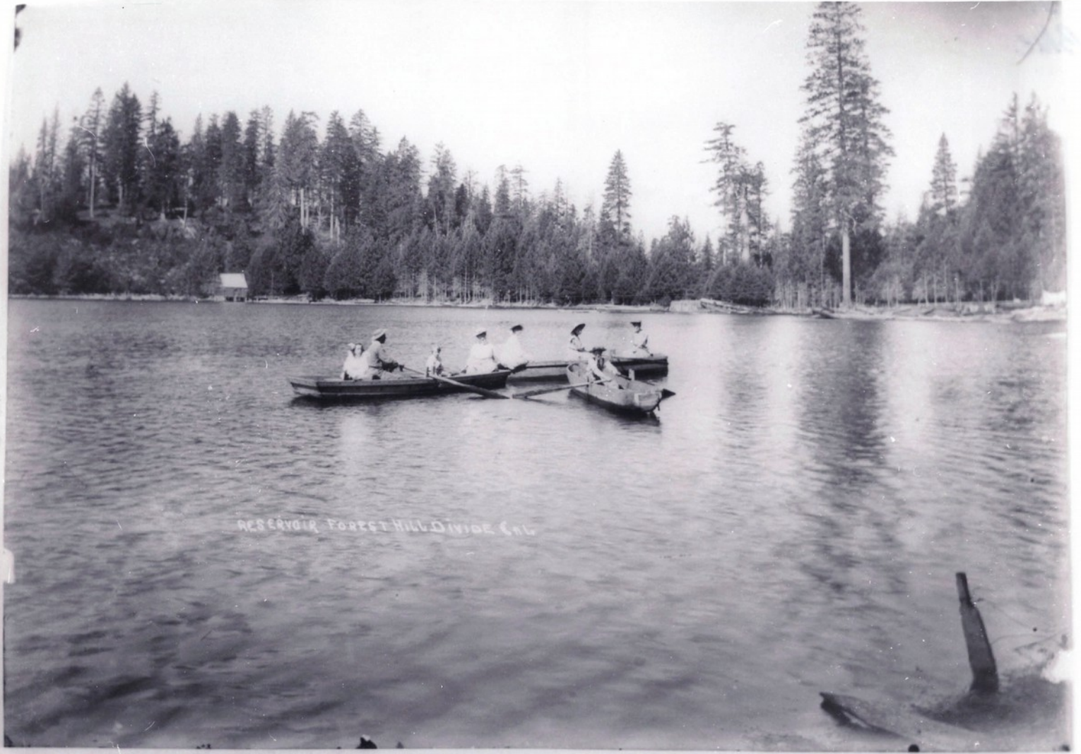
RESERVOIR FOREST HILL DIVIDE CAL.