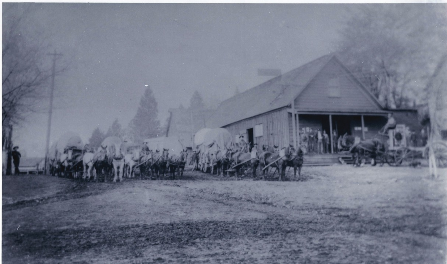
Ford's Blacksmith Shop. Forest Hill, Cal.