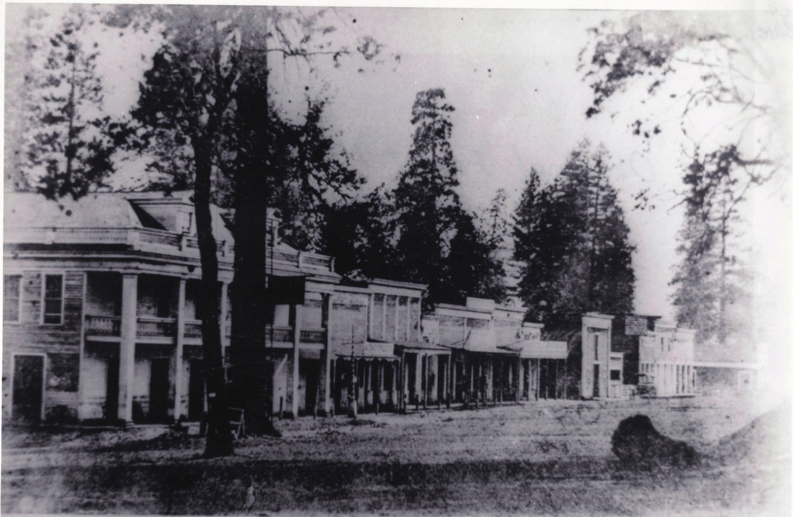
Main Street Foresthill 1858. Forest House on corner. When Foresthill on the hill was built, it was determined this street should equal Market Street in San Francisco.