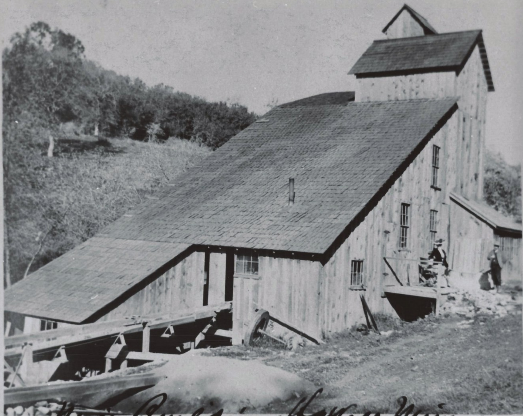
Mill Building, Haskell Mine