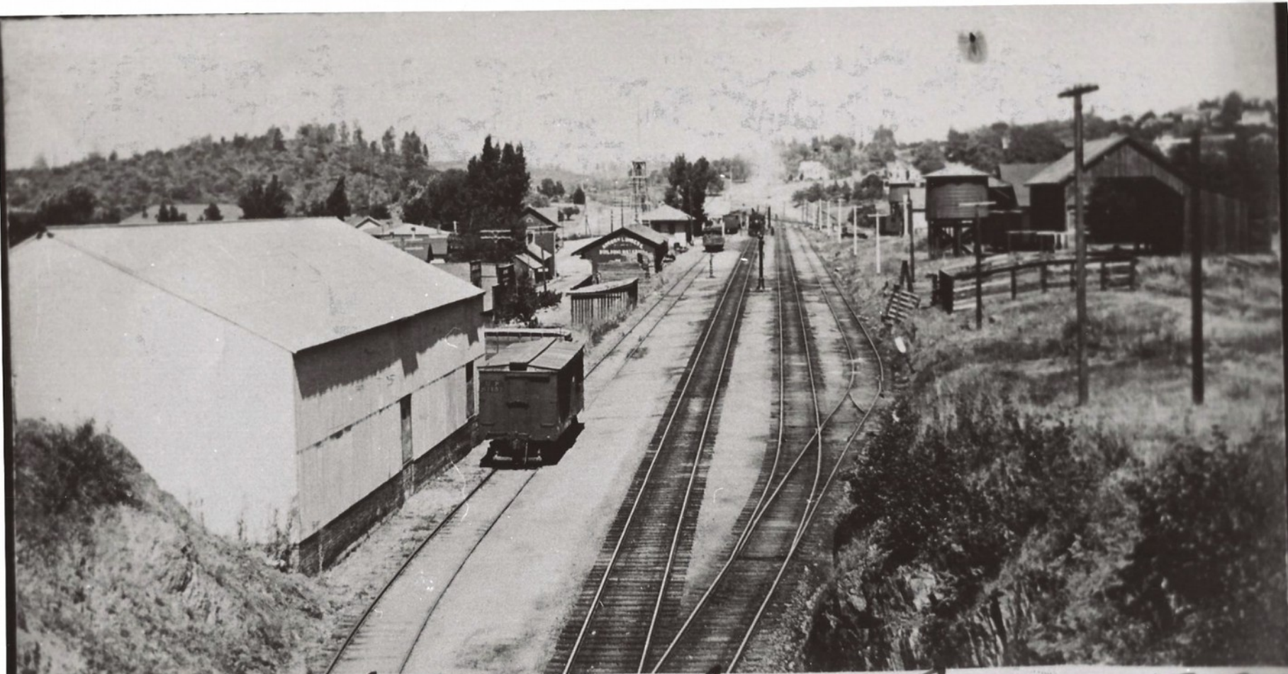
Auburn Station, on Central Pacific R.R.