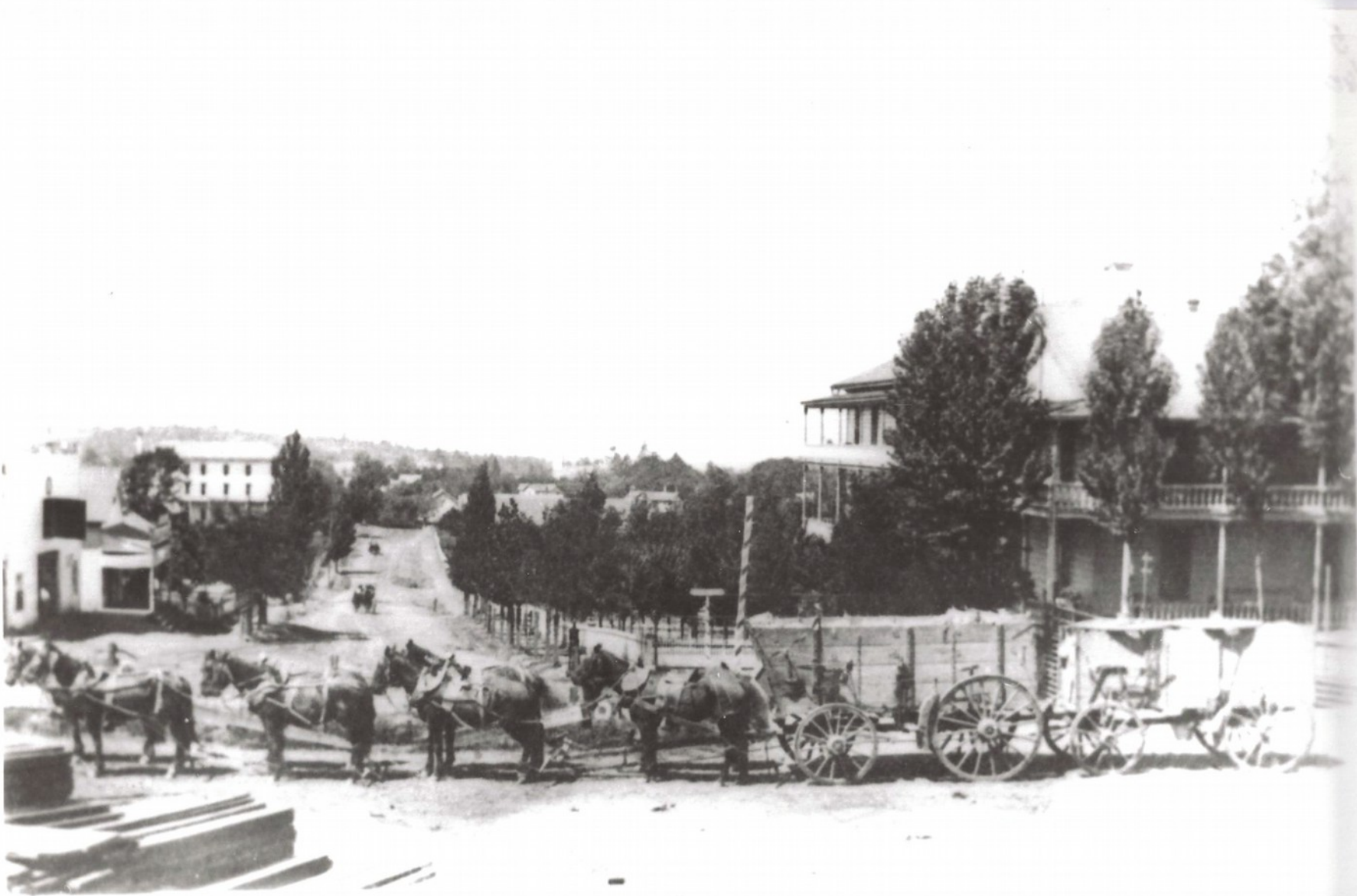
An eight-horse team drawing lime-rock from the quarries. Freeman Hotel at right.